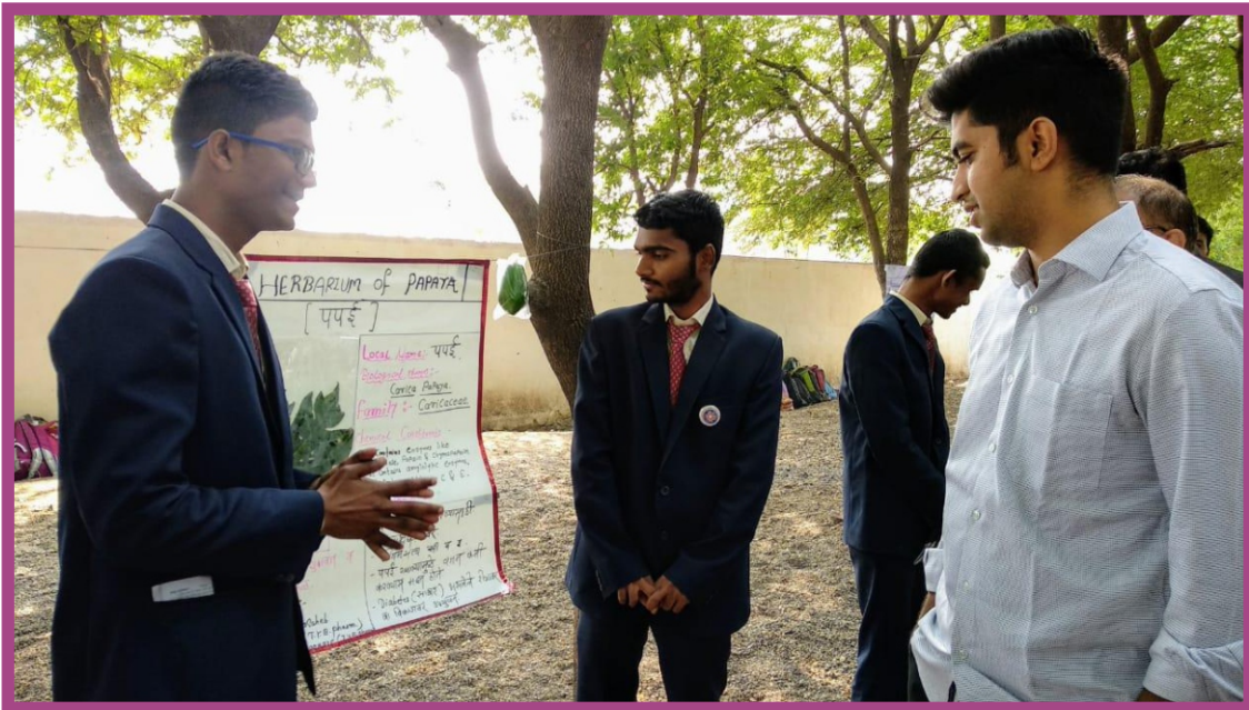
Herbarium Presentation by NSS volunteers to Hon. Udayan Patil Gadakh.