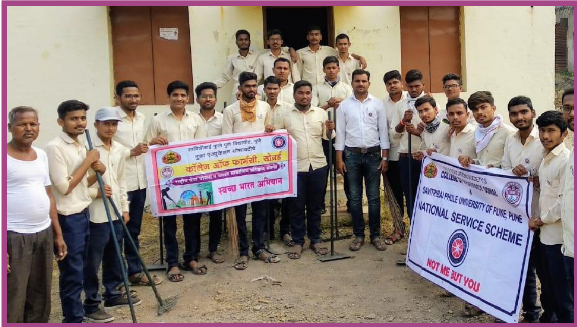
Swach Bharat Abhiyan.