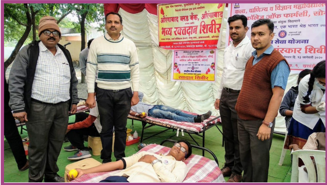
Blood Donation Camp during NSS special Camp 2019-20