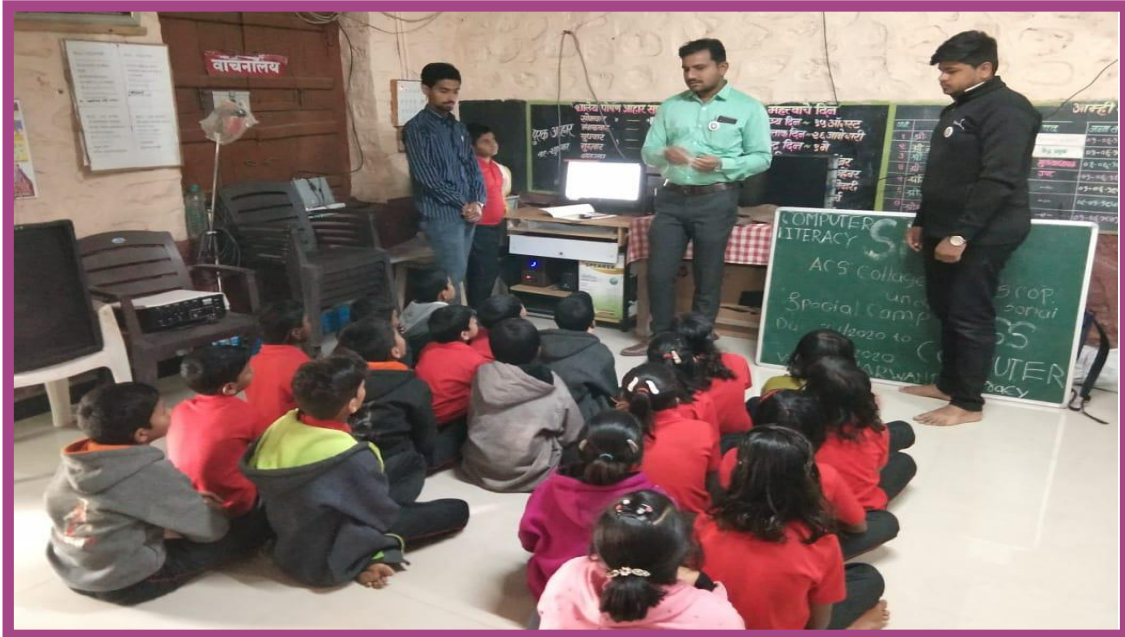
Computer Literacy Program NSS special camp 2019-20.