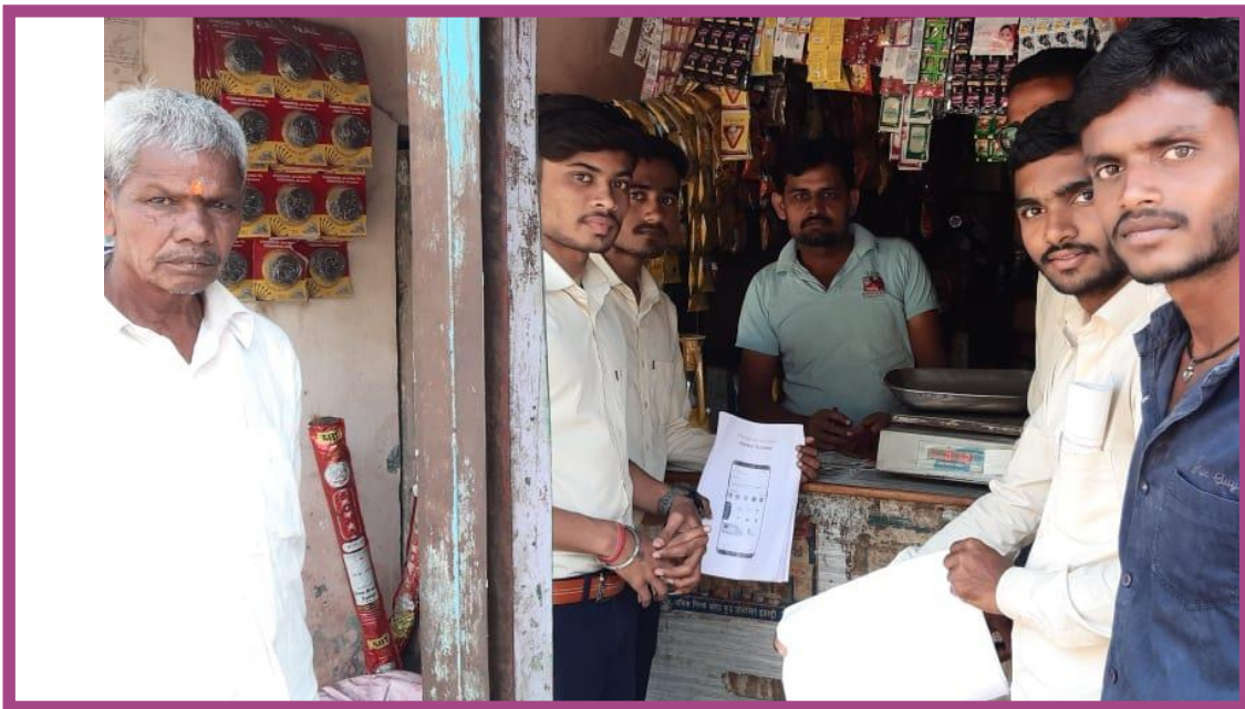
BHIM App Awareness During NSS special Camp 2019 -20