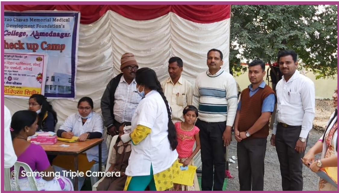
Free Dental Checkup during NSS Camp