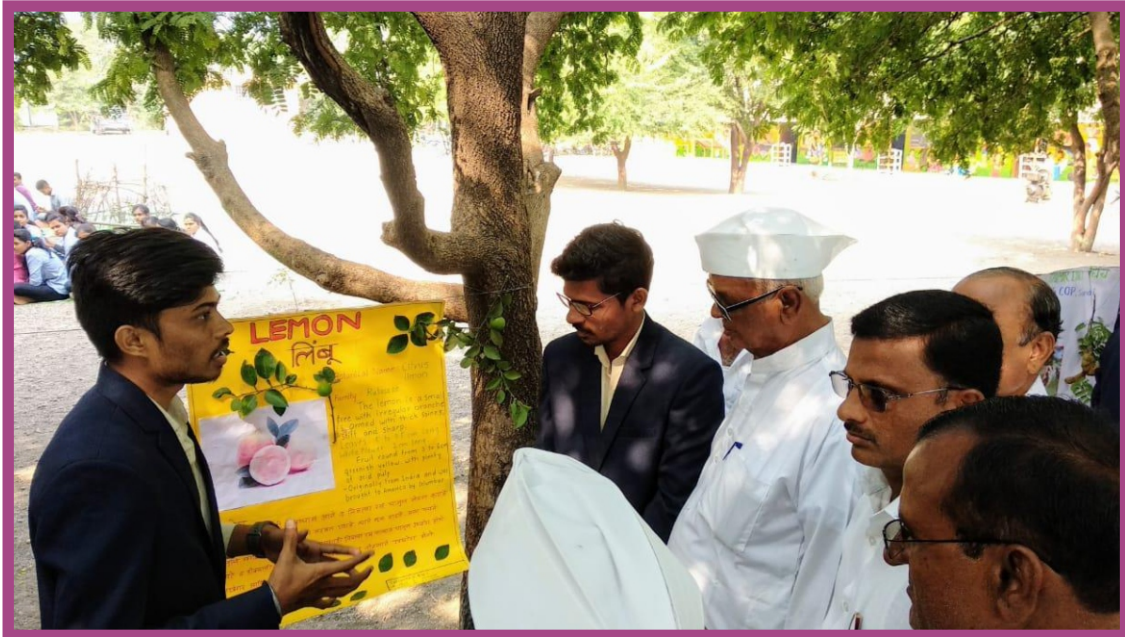
NSS volunteers explaining medicinal plants and their uses found in Kharvandi village.