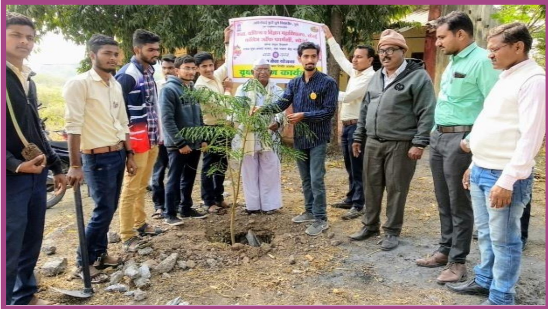
Tree plantation by NSS volunteers in Kharvandi village.