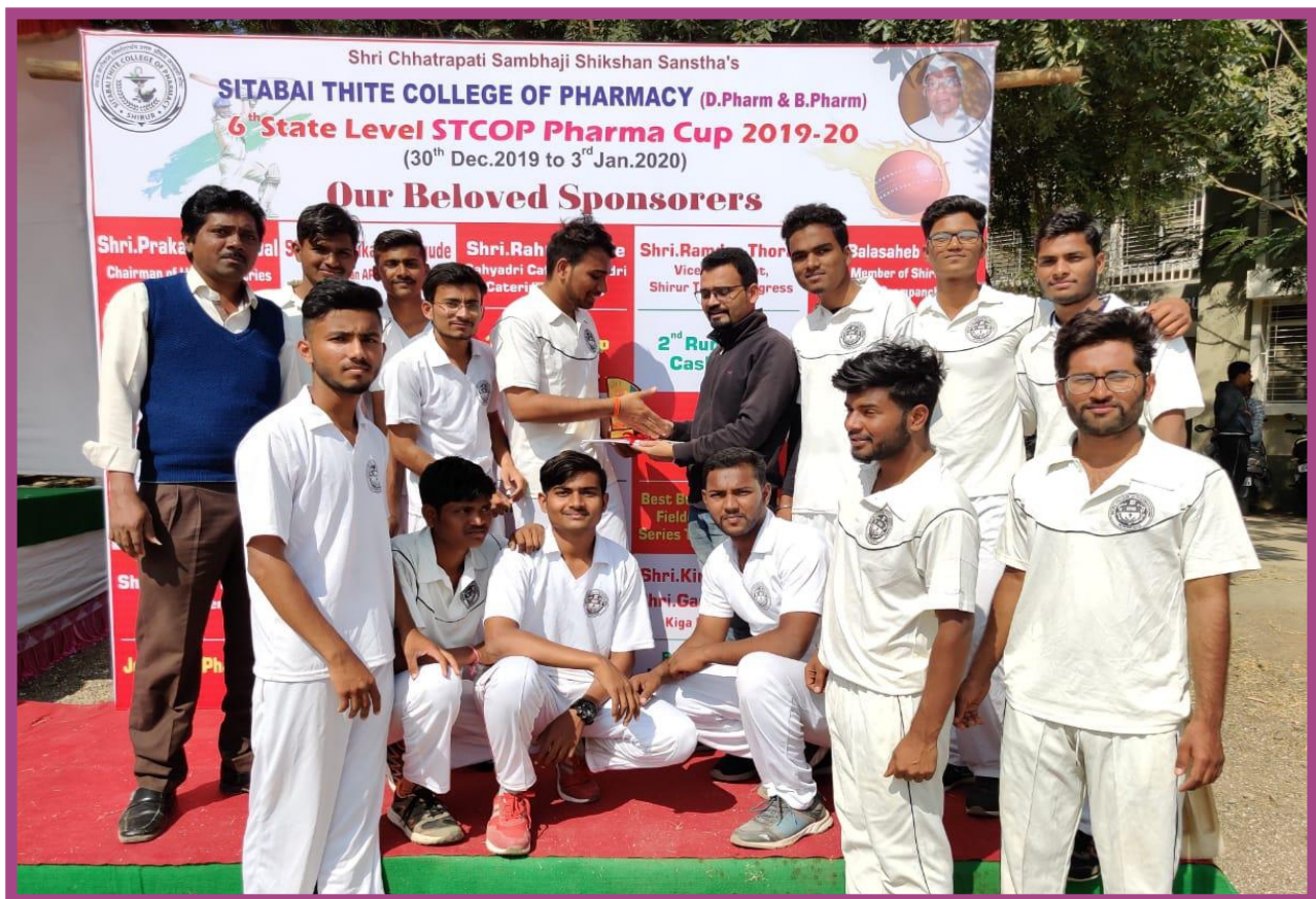
6 th State Level STCOP Pharmacup 2019 – 2020. Organised by : Shri Chhatrapati Sambhaji Shikshan Sanstha's Sitabai Thite College of Pharmacy, Shirur (Ghodnadi), Tal – Shirur, Dist. Pune – 412210

MES's COP Team has participated in 6 th State Level STCOP Pharmacup 2019 – 2020. Which was Organised by Shri Chhatrapati Sambhaji Shikshan Sanstha's, Sitabai Thite College of Pharmacy, Shirur on 31 st December 2019. Team has received Participation Trophy and Certificates.